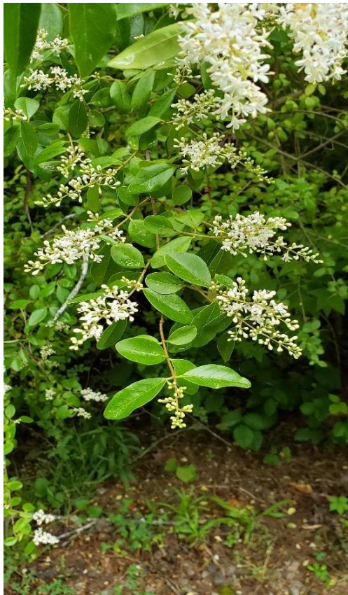
Pictured is the Chinese species

Woody shrubs introduced as ornamental hedge plants. Feature fragrant white flower clusters that produce toxic berries. Spreads easily via root sprouts and by seed dispersal. Privets form dense stands in the understory of forests, altering wildlife habitat.