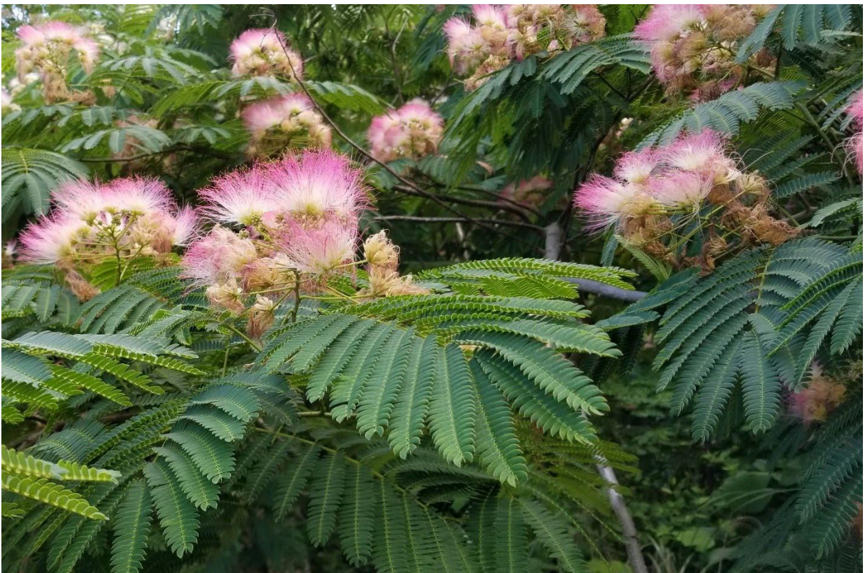
Mimosa leaves close at night

Sometimes planted as an ornamental. Quickly spreads via production of many long, pea-like seed pods with seeds that remain viable up to 50 years. Mimosa limbs are weak and easily broken. Each tree lives only about 30 years. Strong competitor to native trees in open areas or forest edges.