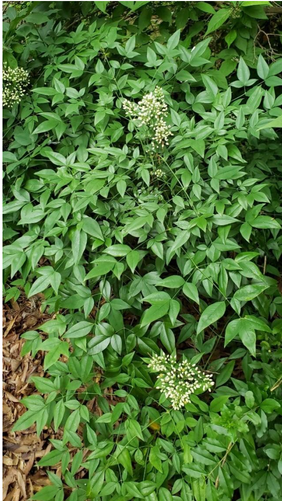
Berries turn red in the winter

Evergreen woody shrub that resembles bamboo. Still sold as an ornamental by garden centers. Can be found in disturbed areas and forms thickets in woods. Berries, red when mature, and can be toxic to birds and animals.